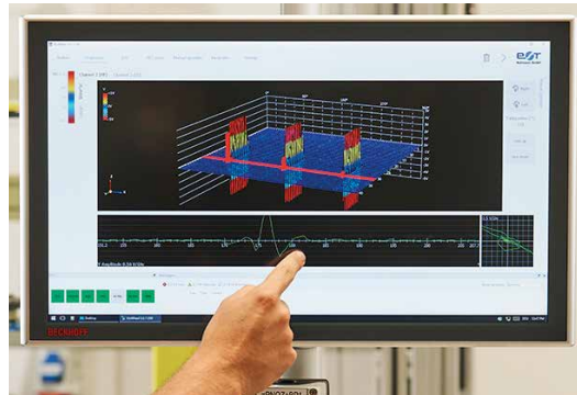
The industrial multitouch screen is mounted so that it can swivel, so that all parameters can be selected on it. It can also be used wearing gloves.

The selection and creation of new parameter sets is clearly displayed, so that rims can be selected safely and quickly. The status information of the system is always displayed.