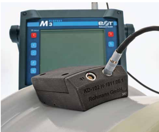
Manual surface crack detection with adapted contour sensor