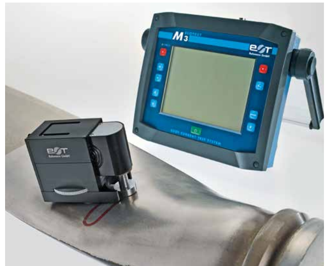
Dynamic surface crack detection rotor blade