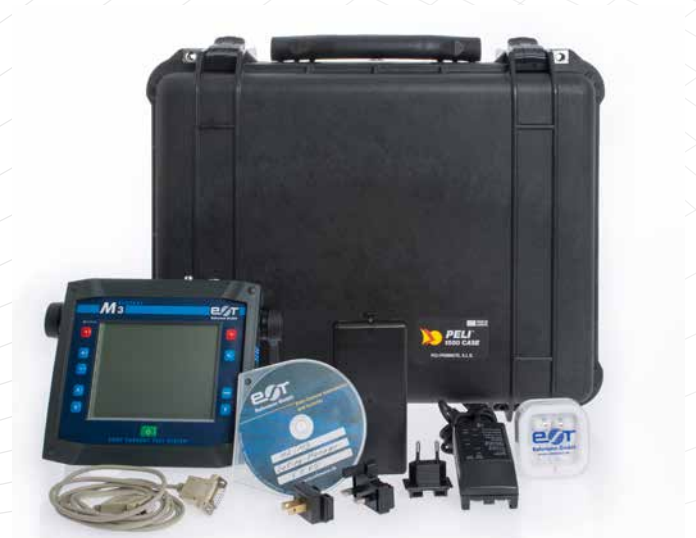
ELOTEST M3 Set