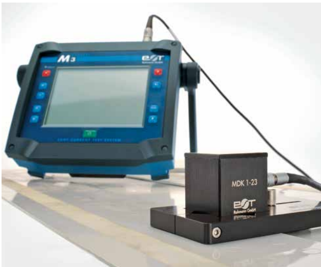
Crack detection of hidden defects in aluminium rivet layers